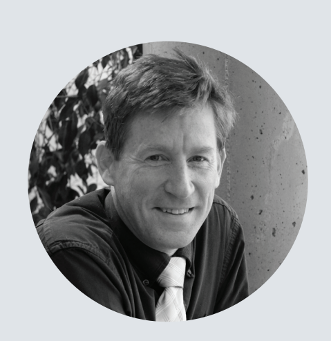
Network manager at the European Agency for Occupational Safety and Health (EU-OSHA)

"It is not possible to change an organizational culture without the full involvement of the workforce."